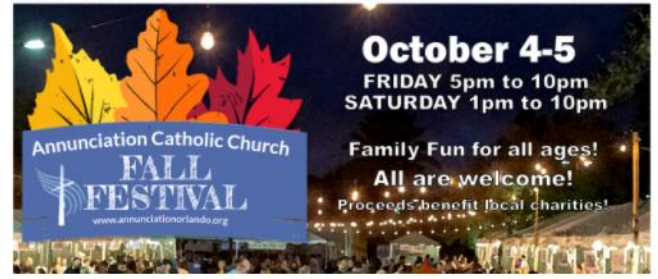
Fall Festival - October 4-5

Interested in Sponsoring? Place your business in front of thousands of Festival goers. Learn more at: www.annunciationorlando.org/fallfestival